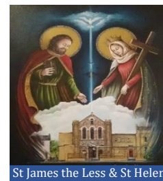
St James the Less & St Helen