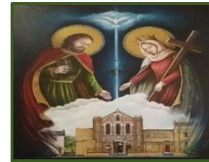
St James the Less & St Helen