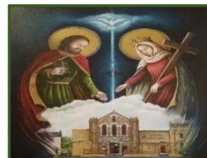
St James the Less & St Helen