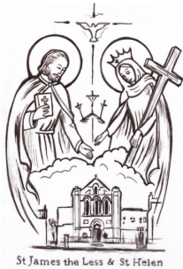
St James the Less & St Helen